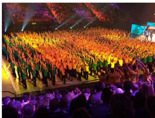
That's us, first yellow line, ready to sing "River Deep".