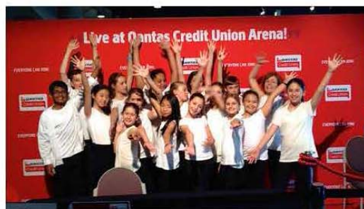
The Summer Hill Choir – stars in the making!