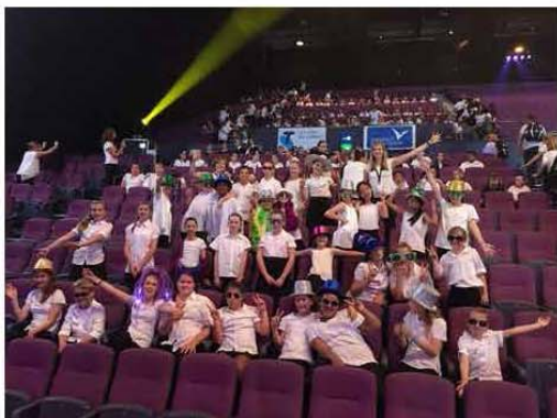
That's us with Gloucester Public school, ready to party!