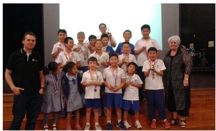
The school held its annual chess comp last week. Congratulations to all the participants who gave it their all and to those that demonstrated our three R's. Well done!

Visit Summer Hill Public School website for more Community News, High School information and School Holiday Programs.