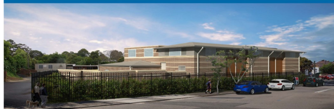
Photomontage of the proposed substation – view from James Street, Summer Hill